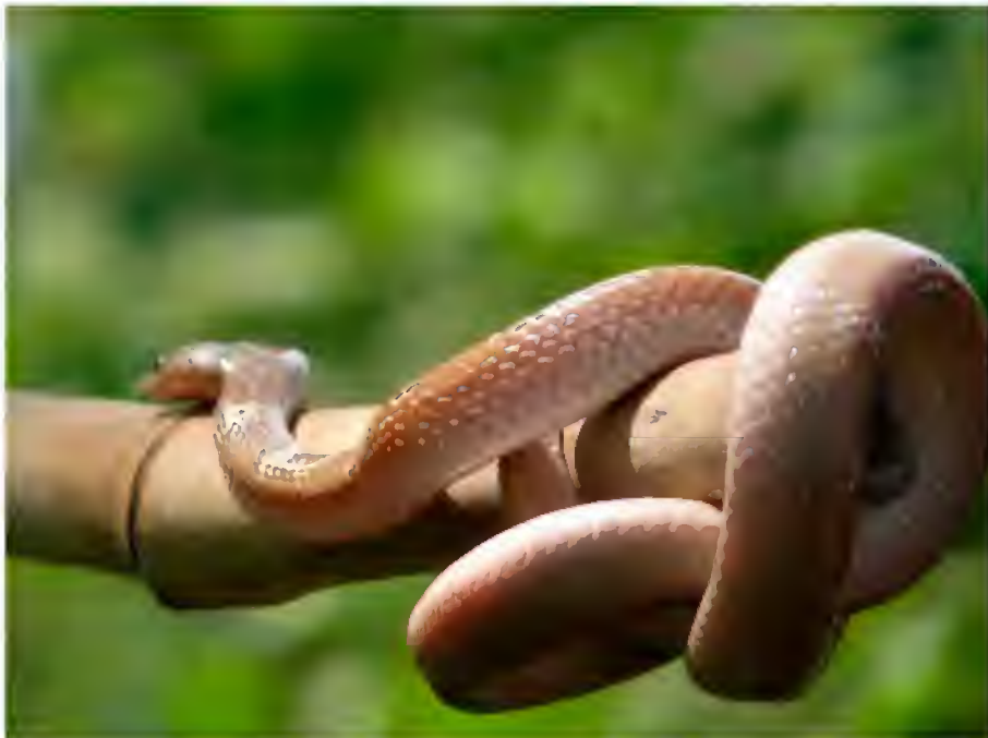
Fig. 2M. Indian Ratsnake Ptyas mucosa .